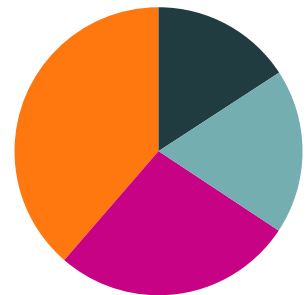
Practicum Exam (PRAC 2.0) 120 Questions | 4 Hours to Complete

EXAM SUBJECTS: Programming and Site Analysis Codes and Standards Building Systems and Integration Contract Documents