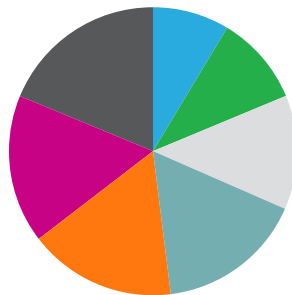
Interior Design Professional Exam (IDPX) 175 Questions | 4 Hours to Complete

EXAM SUBJECTS: Professional Business Practice Building Systems and Integration Contract Administration Project Coordination Contract Documents Product and Materials Coordination Codes and Standards