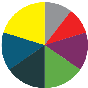
Interior Design Fundamental Exam (IDFX) 125 Questions | 3 Hours to Complete

EXAM SUBJECTS: Construction Drawings and Specification Technical Drawing Conventions Programming and Site Analysis Furniture, Finishes, Equipment, and Lighting Building Systems and Construction Human Behavior and the Design Environment Design Communication